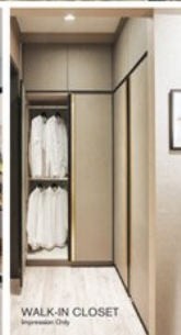
WALK-IN CLOSET Impression Only