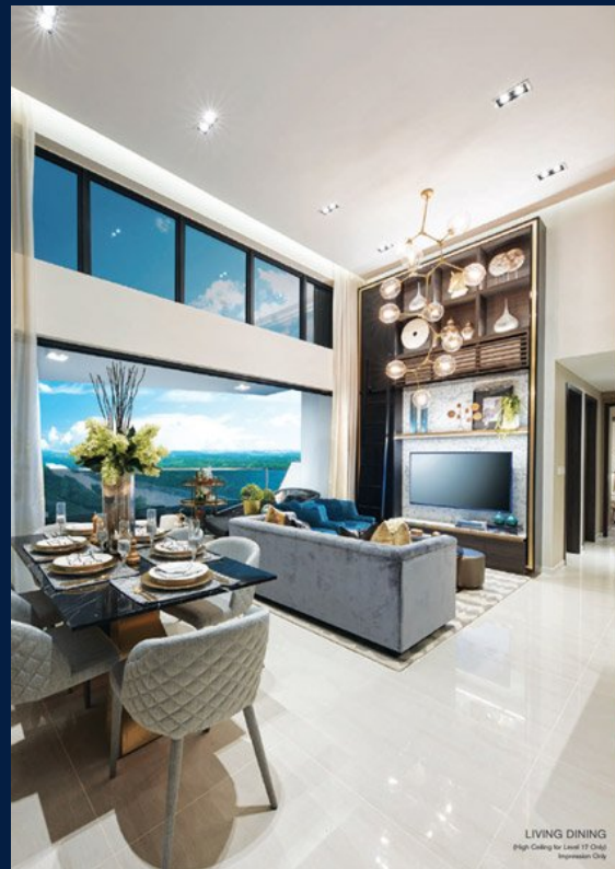
LIVING DINING (High Ceiling for Living & Dining) Impression Only