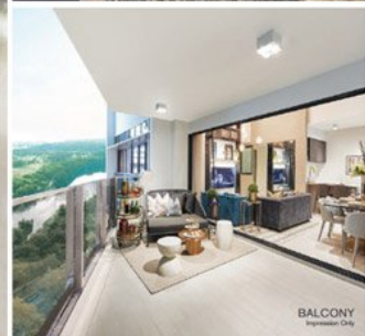
BALCONY Impression Only