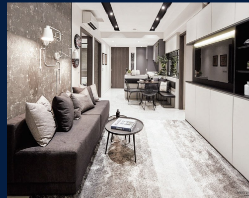
1 - Bedroom + Study